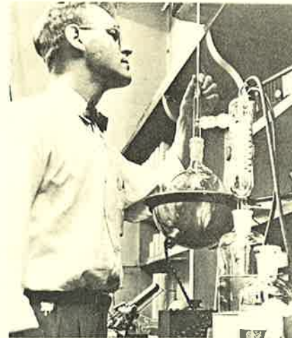
Research aids fight against cancer.

About 45,000,000 Americans now living will eventually have cancer; it will strike in approximately two of three families; it will strike one in four Americans now living if the present rates continue; and it can strike anyone at any age.