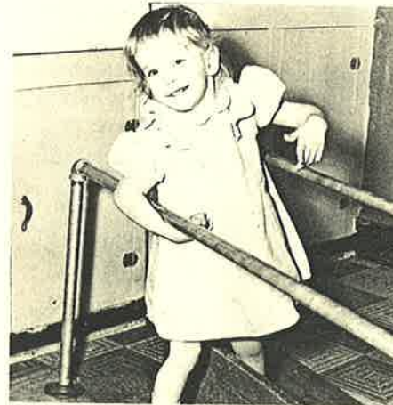
Learning to walk.

But they have learned to fight back. At the Rockford Easter Seal Center, 428 Sixth Street, trained therapists work hard to guide these unfortunates back to a normal, healthy life, or as near as they can hope to come to one.