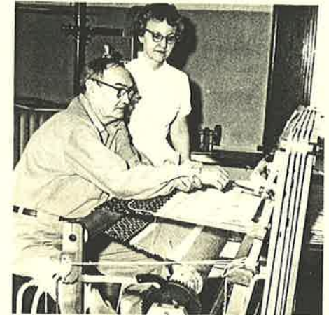
Wants to be useful again.

In addition, each year the center provides a vacation outing for handicapped children at a special summer camp equipped and staffed for the purpose of giving these children a safe, healthful and happy vacation. For those who cannot afford the fee, "camperships" are provided.